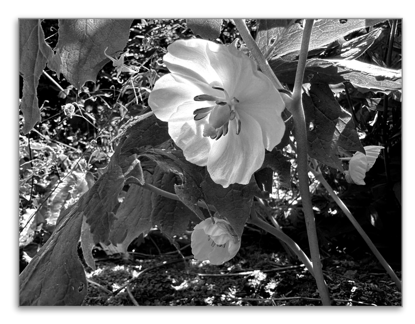
Iris and Poppy

of mauves and purples with the pale yellow of Rhododendron Wardii and other pops of orange and coral. These old irises and alliums are reliable although not usually so prolific. My new fleshy toned curly ones stand out but sometimes look as if it could be their last show. At least Iris Pass the Wine looks robust.