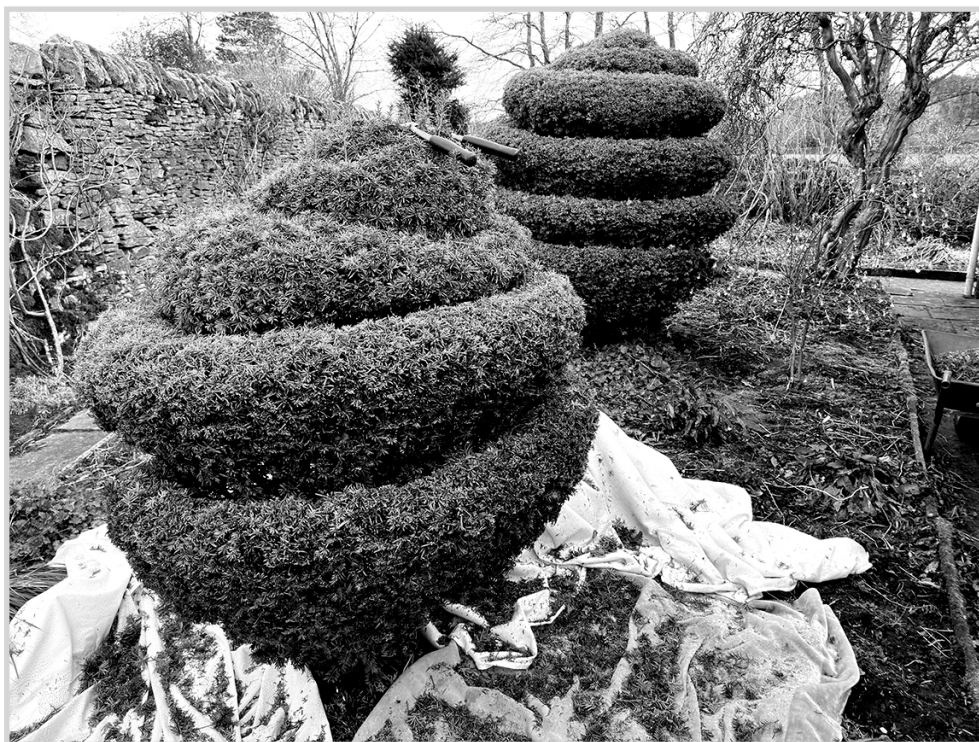
Yew spiral pruning

This is a good time to thin out and move biennials into new places. Biennials are valuable and easy. They grow one year, flower and set seed the next - then usually die. Most people know foxgloves, honesty and teasels as biennials; all are