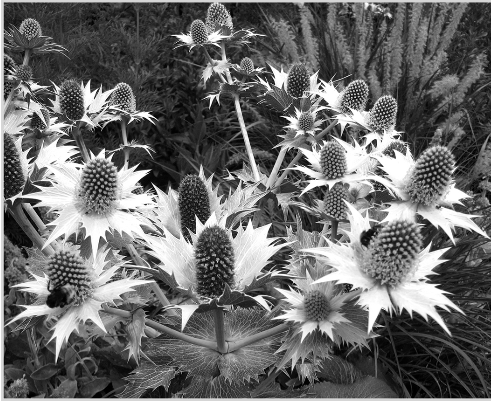
Miss Wilmot's Ghost