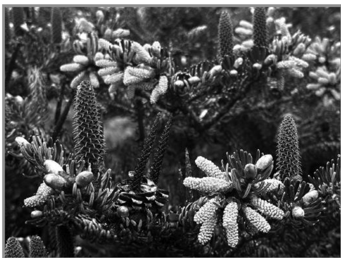
Abies Koreana Silverlocke

The food cycle starts afresh. The soil is ready in the veggie garden with only the last of the asparagus broccoli just sending up succulent shoots to eat, stem and all. We have started to plant the potatoes, broad beans, early lettuce, spinach, rocket, seakale. The tomatoes are in the soil in the greenhouse with a new hooped cover over them. Pots of courgettes, sweetcorn, and french and climbing beans and trays of onions and leeks are waiting to go out when the soil warms a bit more. We'll put up the pea supports in a few weeks. Winter brassicas are the latest to be sown in pots, along with successional greens. The warm and dry spells have spurred us on this year.