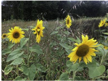
Field edge sunflowers

The grandchildren asked my husband what was the most exciting thing he had done in his life, expecting something like- climbing Stromboli, or going down a river on a raft in Sumatra to meet a waiting helicopter. But, nothing like that. He said it was digging, by hand, a well at the bottom of the garden. Surprise here all around! Well, the water here is now about a meter lower than when it was dug many years ago; the water table has gone down. (Yorkshire Water is already warning about this.) We don't like to use water on the flower garden in summer, except for seedlings or newly planted things. When we haven't had rain for a month in the summer, I wonder, should I be planting more Mediterranean plants that thrive in the heat, like Artemisia , Salvia , Pentstemon , Verbena bonariensis , things that thrive when I give them to my daughter down south living on an arable farm. Then we get rain for days, cold snaps, and all the rest of the unpredictable weather; it is definitely colder up north.