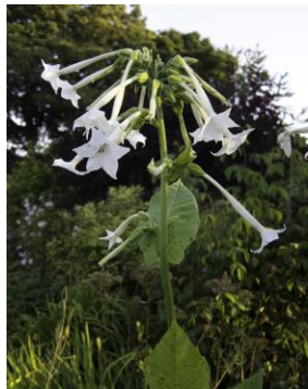
Nicotiana glauca White Trumpet

My daughter's farmland soil copes well with shrubs, roses, hot climate perennials, like bearded irises and grasses, but not so well with some of my favourites, Lysimachia Clethroides , Hemerocallis flava , Dicentra oregana and Dicentra formosa . The margins of their large arable fields are planted with "bumble/bird" seed mix. Crimson clover , Phacelia , Camelina , and birds foot trefoil shine out in summer and tall sunflowers are very cheerful along the footpaths around the field headlands. Her husband says crop yields aren't much affected in a large field, as the margins are the least productive areas, often more shaded, and needed for turning machinery. What a pleasure to walk among the flowery edges so full of bees and butterflies.